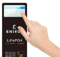
7-inch touchable screen